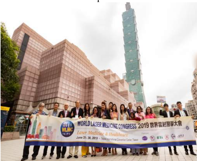
Group Photo in front of 101 building