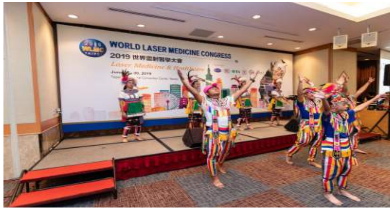
Up to down - Social event of Gala Dinner, Aboriginal dance