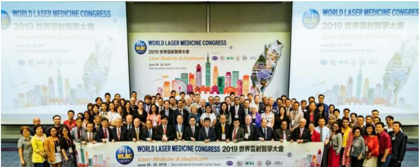
Congress Group Photo on June 29, 2019