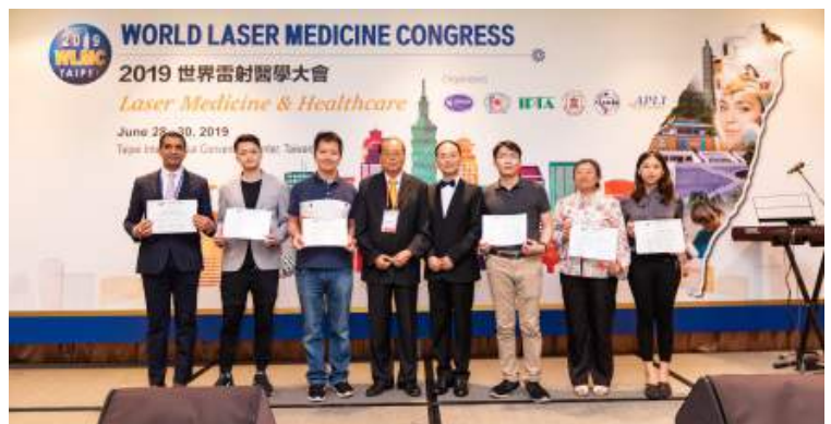
Best Poster Award